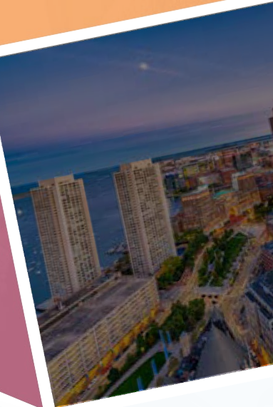
Exhibit at the